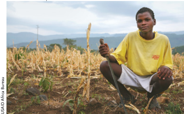
USAID Africa Bureau

Warmer temperatures may also facilitate expansion of the habitat range of certain crop pests and diseases, such as corn root worm and brown rust, as well as wind-borne livestock diseases, such as bluetongue and Rift Valley fever. 27 In addition, increases in daily temperatures and temperature variation could raise the frequency of food poisoning, further threatening public health and social stability. 28 According to the IPCC, warmer seas may lead to increased cases of shellfish and reef-fish poisoning, as well as increased diarrheal disease in both adults and children. 29