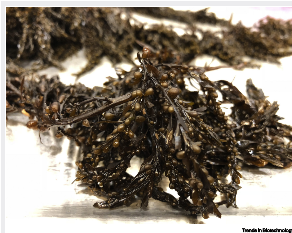
Figure 1. Macroscopic View of Biomass Heterogeneity (Air Bladders, Blades, and Stipes) of Sargassum muticum , an Invasive Species. Seaweed collected from local San Diego shores, used for microbial degradation studies.

adaption that is adapted to live off the dissolved organic carbon (DOC) exudates from seaweeds [67,68]. The DOC studied comprised a complex mixture of major chemical compound classes of carbohydrates, protein, and lipids and thus microbial populations found associated with these products are likely harboring the necessary deconstruction and metabolic conversion machinery and can provide insights into seaweed polymer deconstruction activities [67,69].