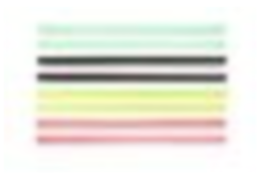
Loliware's seaweed-based straws.

Loliware first got attention on Shark Tank for making edible cups; it's since moved on to straws. The seaweed-based, pastel-colored products are compostable and marine safe, and companies as diverse as Marriott, the liquor company Pernod Ricard, and the Museum of Modern Art have picked them up. The Beacon, N.Y.-based company is in the process of developing seaweed products in anticipation of the EU ban on plastic cutlery in the first quarter of 2020. It's also crafting paper pulp from seaweed—"the first aquatic paper that doesn't use terrestrial based resources, or trees," according to CEO Briganti—and seaweed products to replace the poly bags prevalent in fashion merchandising.