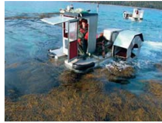
(3) Vessel with a paddle wheel cutter, used to harvest Ascophyllum nodosum in Norway © Sander.