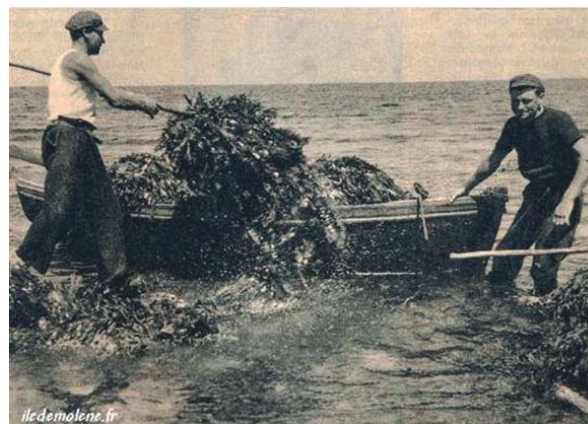
Kelp harvesting on Molène Island (Brittany, France), 1953, Revue Semaine du Monde, © molene.fr

In the 19 th century, the use of seaweed shift from for the potash production for the glass industry to the production of iodine. The iodine production constituted the main use of seaweed until the 2 nd World War when chemical material replaced seaweed. The European seaweed industry however persisted thanks to the discovery of hydrocolloids and especially alginic acid. Even the first extraction of alginates began early in some countries, it was only at the end of 1950's that industrial production became established.