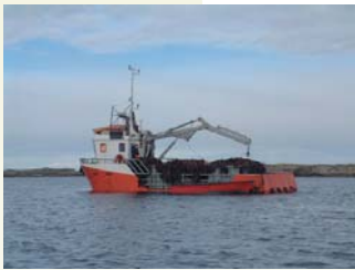
(1) Vessel with seaweed trawl, used to harvest Laminaria hyperborea in Norway

Mechanical harvesting is undertaken by boats and is mainly practiced in Norway (Rogaland to Sør-Trøndelag), France (Brittany), Spain (Galicia and Asturias) and to a lesser degree in the Basque country (France) and Ireland. The development of the mechanization of seaweed harvesting occurred in the middle of 1970's in France and Norway in response to the increasing demand for raw material for the alginate extracting industry. The evolution and success of mechanization was due to the close collaboration between scientists and fishers, and to exchanges between these two countries.