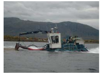
(4) Vessel with a vacuum-sucker, used to harvest Ascophyllum nodosum in Norway © Rebours.

In Norway, Laminaria hyperborea and Ascophyllum nodosum are harvested by boats using respectively a seaweed trawl (1) , a paddle wheel cutter (3) or a vacuum-sucker (4) . In France, Laminaria digitata is harvested by a boat using a gear called “scoubidou” which looks like a hook that turns around itself and turns out (2) . More recently, Laminaria hyperborea is harvested by boat using similar gear as in Norway.