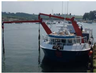
(2) Vessel with a « scoubidou », used to harvest Laminaria digitata on the coasts of Brittany (France) © Maguire.