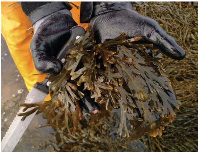
Fucus cutting with a knife

Manual harvesting of seaweed and gathering of storm cast seaweed are important in all the countries studied, with the exceptions of Norway and the UK where seaweed harvesting seems to be limited to domestic use. Harvesters gather either the cast or cut seaweed at low tide. Seaweed gatherers use specific equipment to harvest seaweed, for example knives, rakes, pitchforks, sickles, nets, etc.