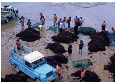
Gelidium sesquipedale harvesting on the coasts of the Basque country (Spain)

In Ireland, the majority of harvesters are not declared except the harvesters, who have a license. Harvesting of Ascophyllum nodosum constitutes a complementary income for the coastal population living in the western coast of Ireland but only a few people are declared as seaweed harvesters. As a result, the number of harvesters is unknown. It seems that in 2011 the number may be higher than in the past due to the economic crisis and the increase in migrants returning to the coast.