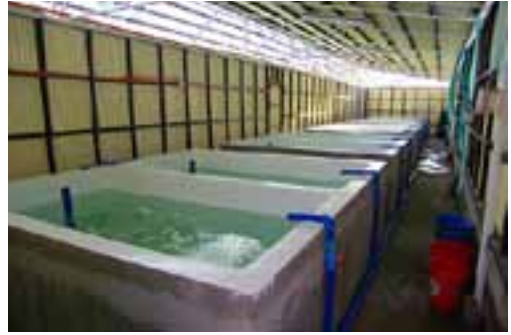
Figure 1. Purpose-built sea cucumber hatchery at the Southeast Asian Fisheries Development Center – Aquaculture Department, Iloilo, the Philippines