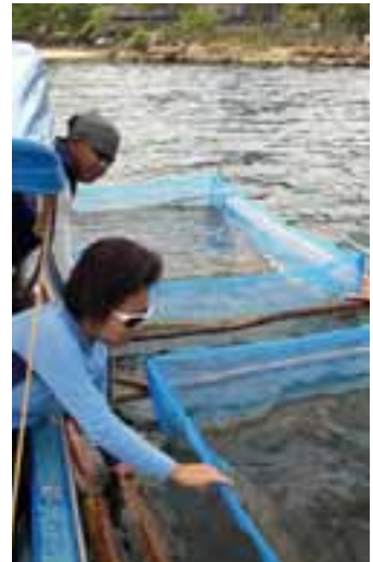
Figure 2. Nursery hapas in a pond at the Research Institute for Aquaculture No. 3 National Seed Production Center, Vietnam (left); and floating hapas in an enclosed marine embayment established by the University of the Philippines Marine Science Institute (right)

extreme risk profile associated with this activity, have resulted in a situation where smallholders have tended to lose out to large corporate interests with the financial backing to recover from stock crashes. Intensification of culture methods has also led to severe fouling in ponds, resulting in anoxic sediments and the ultimate abandonment of ponds. Sea cucumbers potentially represent a lower-risk investment for smallholders. As a species that is low on the food chain, they provide better environmental outcomes than shrimp farming, and do not require feeding if stocked in ponds previously used for shrimp culture.