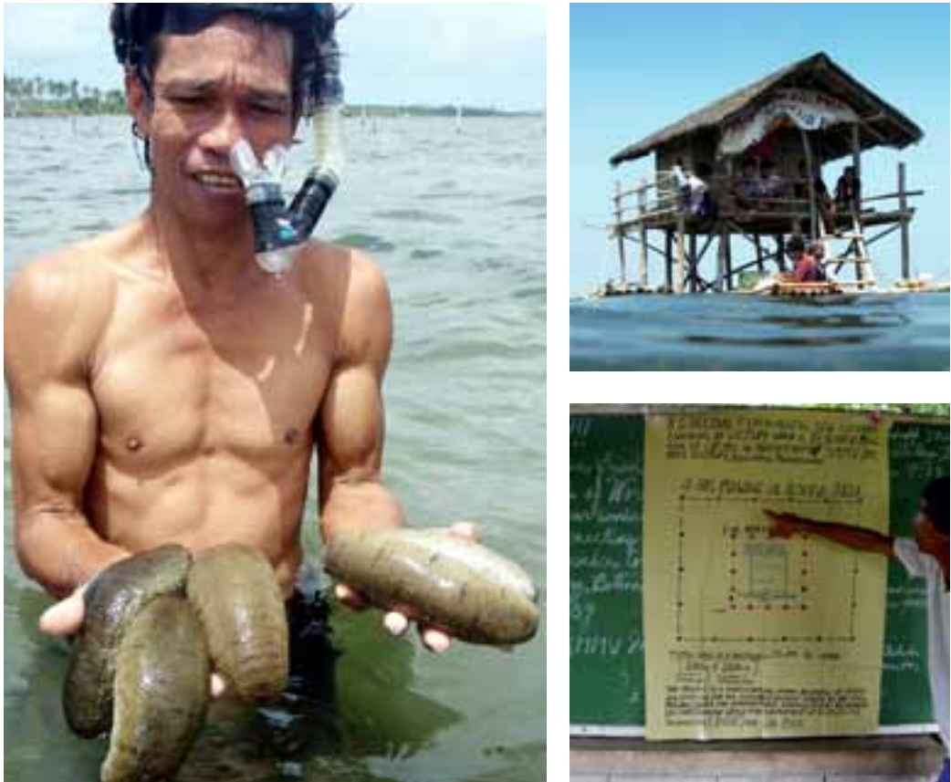
Figure 4. Sea ranching in the Philippines: mature animals from the ranch (left), the guardhouse to counteract poaching (top right) and the leader of the sea-ranching group illustrating the principles of the ranch design. All photos from the Victory sea ranch, northern Luzon, the Philippines

Sustaining engagement: The time from establishing a sea ranch to the first fiscal returns in the Philippines will likely be at least 12 months and possibly closer to 18 months. Once the first batches of released sandfish have reached harvest size, regular harvests will be possible; however, the lack of any