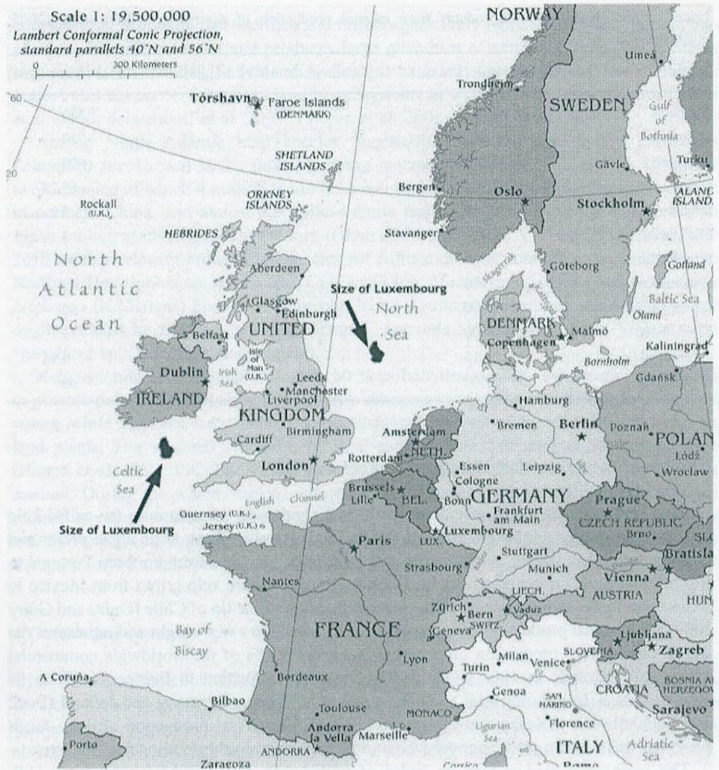
Fig. 1 Size of two 2,500 km 2 seaweed farms depicted in the Celtic and North Sea (indicated by black arrow) both equaling the size of country Luxembourg

of agri-fuel crops such as rapeseed and corn will increase the use of phosphate rock even more (von Horn and Sartorius 2009). Over the last 5 years phosphate rock has increased from $30–40/tonne to $430 in 2009 and diammonium phosphate to over $1,000/tonne. Currently run-off from land washes many nutrients (N and P) into the rivers (causing algae blooms) and ultimately into our inshore waters where it continues to be deposited into the deep ocean. Phosphate recycling from wastewater will be self sufficient at costs of about 100$/t. Especially for European countries without phosphate reserves even slightly higher prices might be acceptable to reduce the dependence on phosphate imports (von Horn and Sartorius 2009). Large-scale seaweed cultivation in inshore and near shore seas could prevent the loss of phosphates and nitrates from run-off as these macroalgae have a high uptake rate of these nutrients (Chopin et al. 2008a; Kelly and Dworjanyn 2008). After harvesting, N and P can be recovered and re-used and thus help the recycling of these important nutrients.