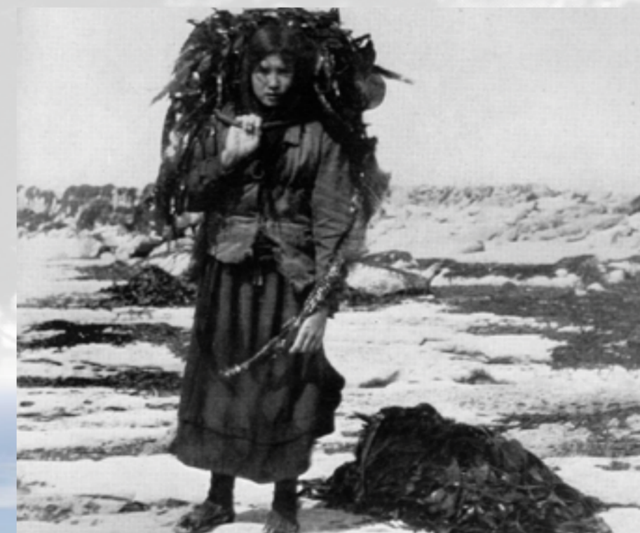
Woman wearing protective coat of goat-skin, carrying wet seaweed from the shore: Aran Islands, Co. Galway, 1900-35.

The reef at Finavarra in Co. Clare is known to harbour 336 species alone and seems to represent the peak of seaweed diversity for Irish and British coasts. Research suggests that the highest diversity occurs on softer and more porous rocks, such as limestone, although other factors – like wave exposure, geographical position, and the use of the location by people – also play a part (Hardy & Guiry 2003).