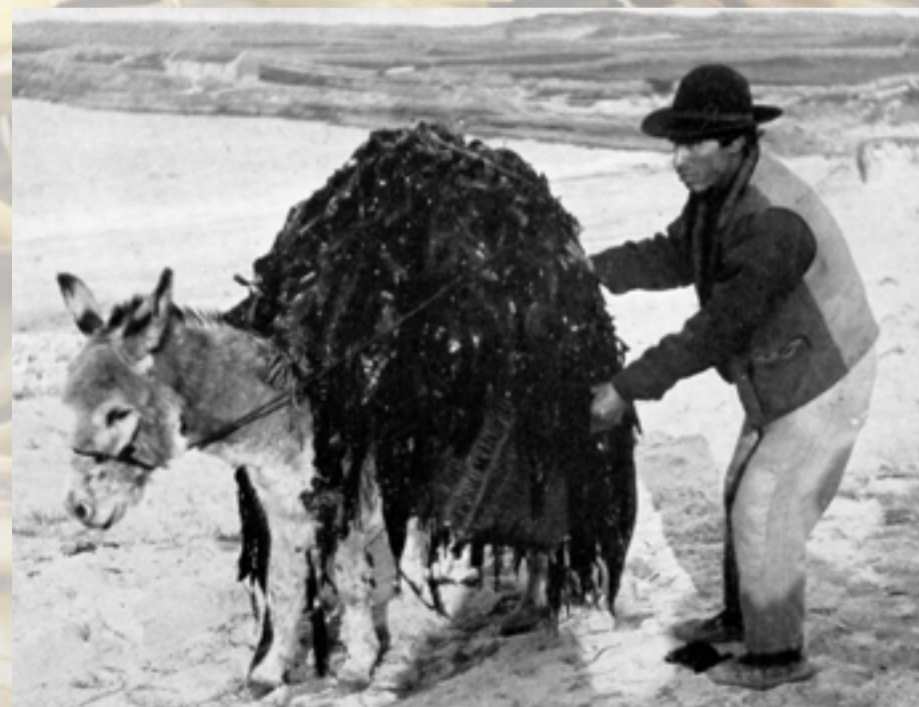
Wet seaweed being taken to a croft for use as fertiliser: Aran Islands, Co. Galway, 1900-35. (T.H. Mason).

In coastal areas with mudflats, or without a rocky shore, stones were moved from the land into the sea to create a place for seaweed to grow. This eighteenth-century practise was recorded in 1912 in Co. Mayo, and is still in use in part of County Donegal, yielding about 1,000 tonnes of seaweed a year.