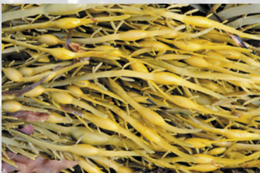
Knotted wrack ( Ascophyllum nodosum ), Tra na reilge (M. D. Guiry)

Ireland's tradition of kelp harvesting dates back to the seventeenth century. Coastal communities gathered kelp from the shoreline, especially after a storm, and burnt it in stone circles known as kelp kilns, the ruins of which are still visible along the west coast. The ash that remained was contained soda and potash, and was used for glazing pottery and for making glass and soap. In the mid-eighteenth century the ash was found to also contain iodine, and this discovery kept the tradition alive until the World War II. Today, small amounts of kelp are harvested for the sea-vegetable industry and as feed for farmed shellfish, specifically urchins and abalone.