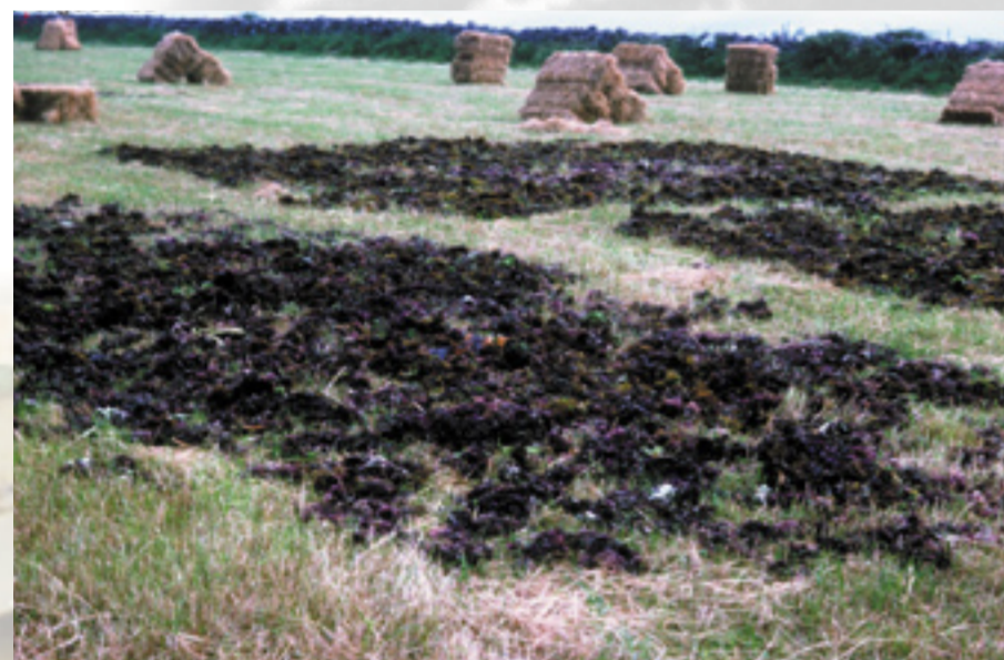
Drying carrageen in the fields near Finvarra, Co. Clare in 1970s. (G. Blunden).

Seaweed harvesting has a long tradition in Ireland. A poem, probably dating from the twelfth century, describes monks harvesting dillisk ( Palmaria palmata ) from the rocks and distributing it to the poor as one of their daily duties. Dillisk, also known as dulse, a red alga that is eaten on both sides of the North Atlantic, has traditionally been used as both a food and a medicine. In the eighteenth century it was used as chewing tobacco, ingested to eliminate worms, and recommended as a remedy for 'women's longing'.