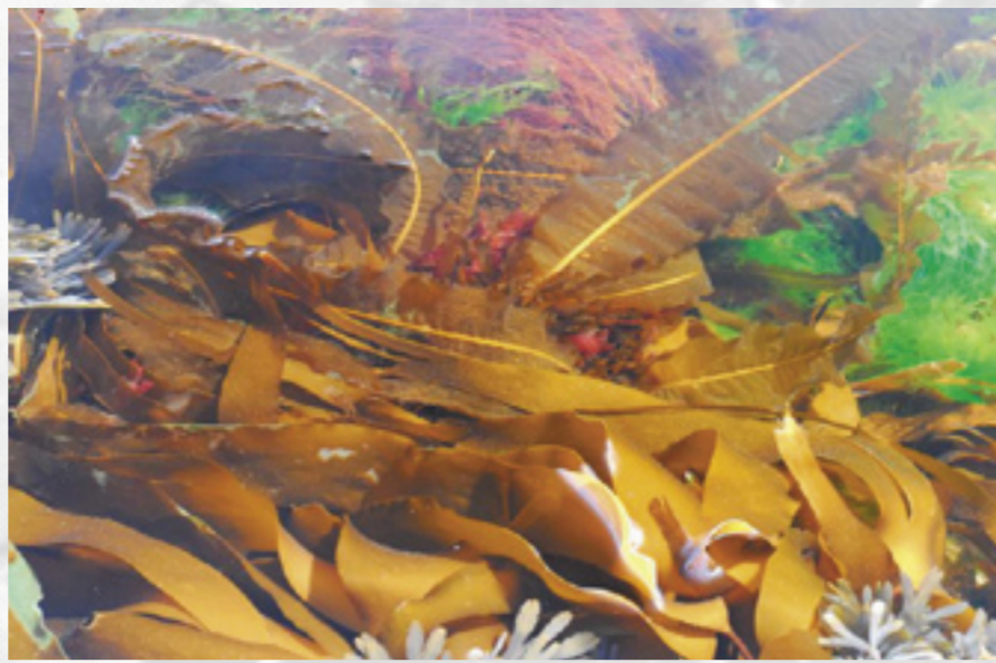
Kelp ( Laminaria digitata ) in an intertidal pool. (M. D. Guiry).

In coastal areas with mudflats, or without a rocky shore, stones were moved from the land into the sea to create a place for seaweed to grow. This eighteenth-century practise was recorded in 1912 in Co. Mayo, and is still in use in part of County Donegal, yielding about 1,000 tonnes of seaweed a year.