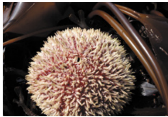
Kelp ( Laminaria digitata ) with the kelp-eating white urchin ( Echinus esculentus ). (M. D. Guiry).