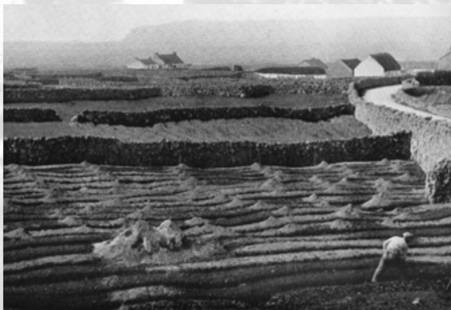
Alternate layers of sand and seaweed laid on bare rock for growing potatoes: Aran Islands, Co. Galway, 1900-35.

Throughout the centuries different types of seaweed were used as a fertiliser, enriching the soil with minerals and growth hormones. Seaweed manure was particularly important in areas with poor soil, and family conflicts were fought over seaweed rights and access. Harvesting rights predate the formation of the Irish State and date back to the British Crown.