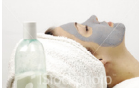
Sea weeds are used in many skin care products due to their high vitamin and mineral content.