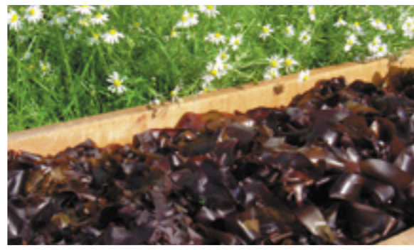
Dulse drying prior to being used in cookery (Prannie Rhatigan)

Thalassotherapy, which takes its name from the Greek word for sea, involves treatment with seawater or seaweed and has been used in Europe for many years to treat liver complaints and cellulite, promote weight loss, and relieve depression. It has found a modern re-invention in contemporary spa treatments. Seaweed bath therapists claim that seaweed hydrotherapy baths are great for softening the skin, reviving and improving circulation, and draining the lymphatic system.