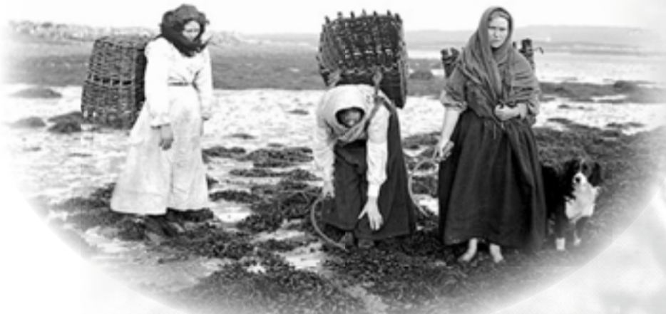
Women gathering seaweed on the Irish coast, 1900-1920.