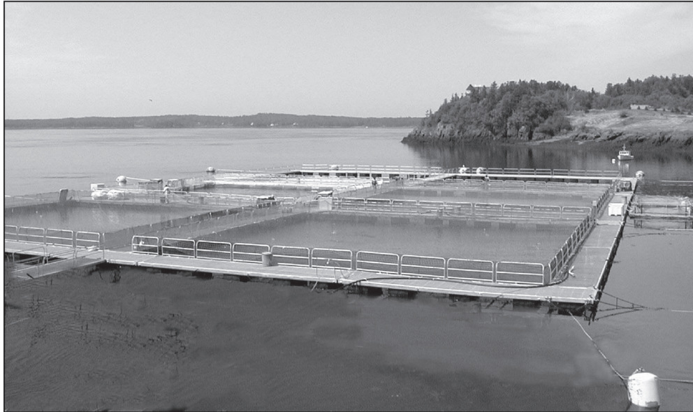
FIGURE 1. Example of modern galvanized steel salmon cages.