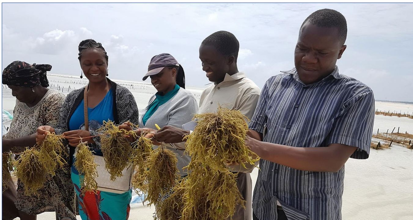
Early career researchers examine seaweed for pests and disease in Tanzania

Introduced, non-indigenous macroalgae can also alter ecosystem structure and function , by changing food webs, monopolising space, developing into ecosystem engineers, removing excessive quantities of nutrients and spreading far beyond their point of introduction, if the cultivars are allowed to escape from the farm. For example, in certain regions of the Philippines and Tanzania, only introduced farmed varieties of Kappaphycus spp and Euचेuma denticulatum can be found in the wild. The inter-breeding of farm 'escapees' with indigenous species may also lead to the impoverishment in the genetic resources of wild stocks, impacting on ecosystem resilience and reducing the potential for future breeding programmes.