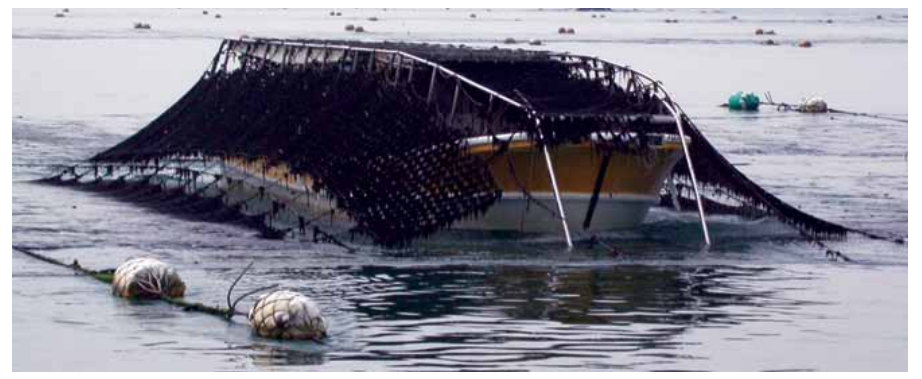
When harvesting nori, specialized boats go under the nets. The red seaweed Porphyra yezoensis is processed into wrappers for sushi rolls and nutritious snacks.

Part I. Lesser-Known Species Group Tops Mariculture Output