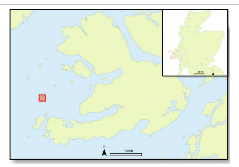
Figure 3 Area needed to grow enough seaweed to meet domestic gas requirements for homes on the Isle of Mull, West coast of Scotland, based on a production of 200 wet tonnes ha –1.

aquaculture, fisheries, energy generation and shipping is required.