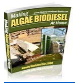
king Algae diesel at Home k here for more ails

That's right, algae doesn't have lignin. Shazam, the perfect workaround. Except that micro algae comes with its own problems. Foremost among them – how do you affordably get the water out of the algae or the algae out of the water? And what, then, do you do with all the residual biomass after the lipids are extracted?