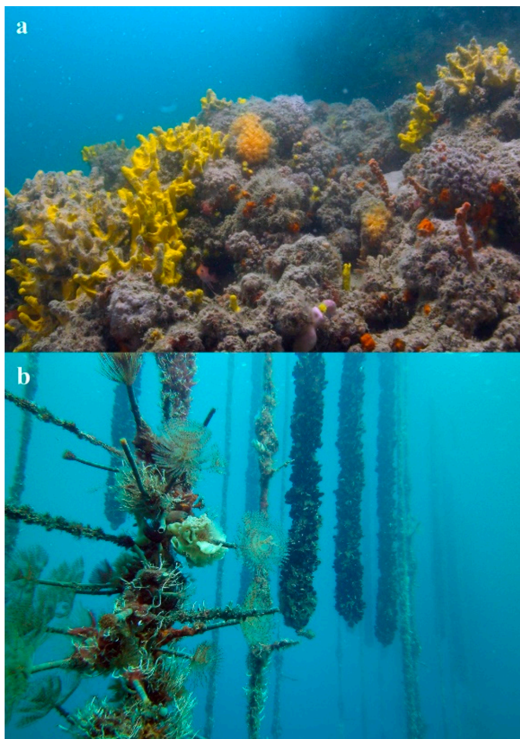
Figure 1. Genuine and induced peculiar marine landscape in the Mediterranean Sea: (a) image of a natural sponge garden in the Southern Adriatic Sea; (b) vertical collectors placed around fish cages hosting a dense and rich filter feeder community.