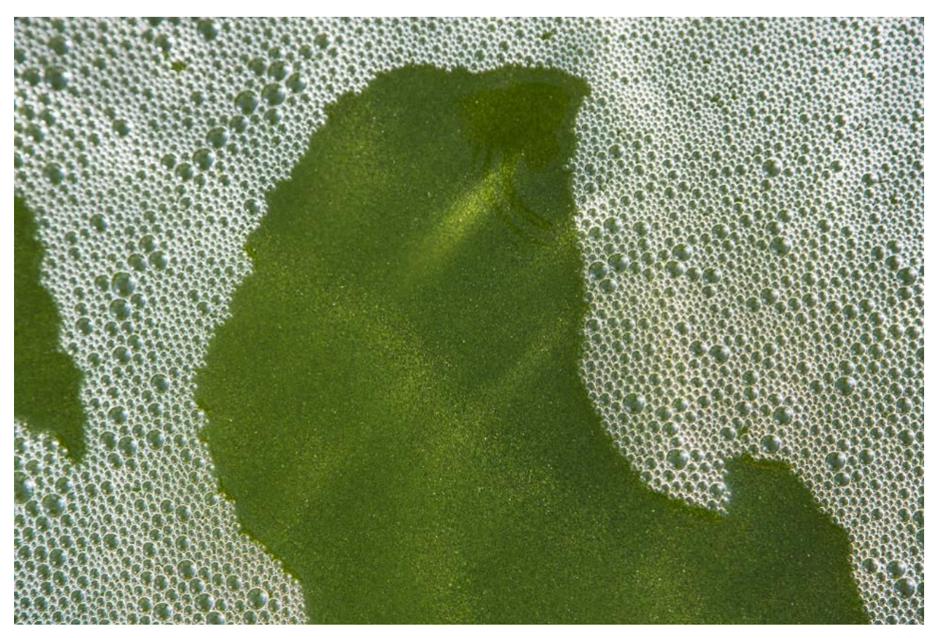
Can marine algae sustainably replace behaviors that are damaging the climate?

From Chicago, I write about green technology, energy, environment.